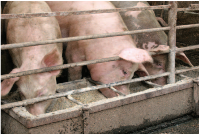
Figure 3. Water to grow feed crops contributes about 98% to the total water footprint of animal products.

cleaning the stables. One will have to know the age of the animal when slaughtered and the diet of the animal during its various stages of life. The water footprint of the animal as a whole is allocated to the different products that are derived from the animal. This allocation is done on the basis of the relative values of the various animal products, as can be calculated from the market prices of the different products. The allocation is done such that there is no double counting and that the largest shares of the total water input are assigned to the high-value products and smaller shares to the low-value products.