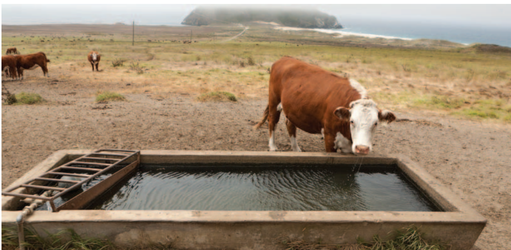
Figure 4. Drinking water contributes only 1% to the total water footprint of beef.

Problems of water scarcity and pollution always become manifest locally and during specific parts of the year. However, research on the relationships between consumption, trade, and water resource use during