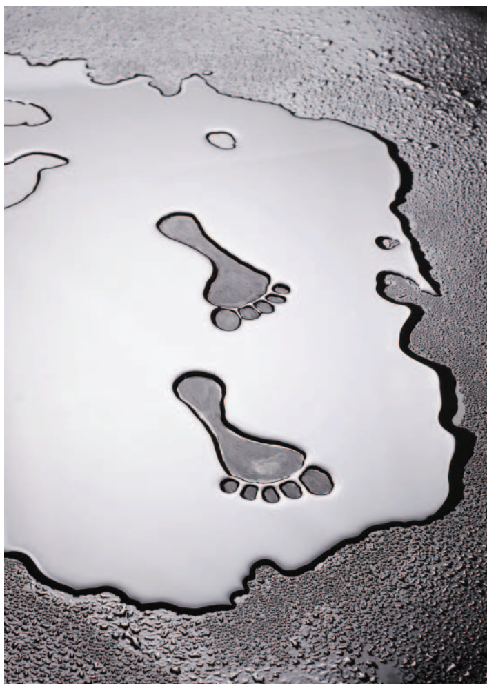
Figure 1. Water footprint: water use to produce goods for human consumption.

The water footprint of an animal at the end of its lifetime can be calculated based on the water footprint of all feed consumed during its lifetime and the volumes of water consumed for drinking and, for example,